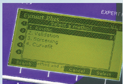
Large choice of calculation methods