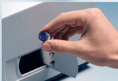
Filters are easily changed