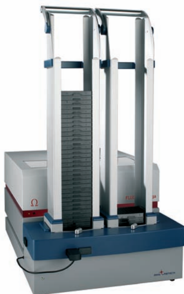
...automated microplate handling with Stacker II

BMG LABTECH's standardized reader footprint and robotic software interface make it easy to integrate the FLUOstar Omega into all robotic automation systems. In addition, a 50-plate stacker with an integrated barcode reader can be added to any FLUOstar Omega.