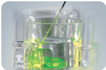
...precise reagent injection in plate formats up to 384-well

Two precision syringe injectors with a delivery volume of 3 to 350 \mu\text{L} , adjustable in 1 \mu\text{L} increments, have direct access to the measurement position allowing simultaneous reagent injection and reading of the plate. Flash luminescence reactions, such as calcium flux measurements with aequorin expressing cells or luciferase based gene expression analysis, can be started precisely and kinetic data can be taken before, during, and after injection. The control software allows you to set injection of injection timing, pump speeds, delay times, and sampling rate for all kinetic events. Up to 250 data points can be collected per well, ranging in intervals from 20 ms to over 10,000 seconds, enabling runs from a few seconds in length to over several days.