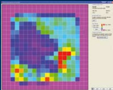
Well scanning with advanced analysis