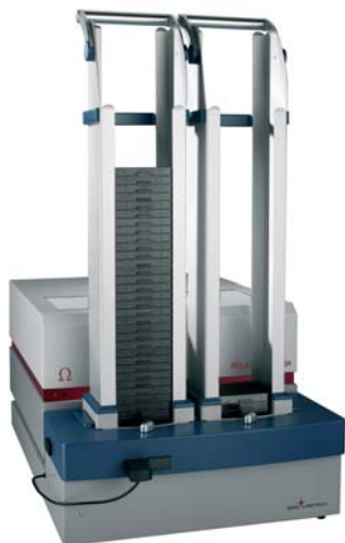
...automated microplate handling with Stacker II

BMG LABTECH's standardized reader footprint and robotic software interface make it easy to integrate the POLARstar Omega into all robotic automation systems. In addition, a 50-plate stacker with an integrated barcode reader can be added to any POLARstar Omega.