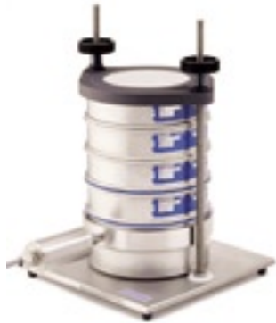
ultrasonic sieving in the laboratory