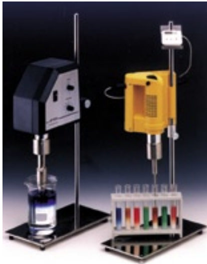
UP400S and UP200H with timer

As desk-space in the laboratory is expensive we supply ultrasonic processors in a compact design: Power supply, generator, control and transducer, all of which are located in an aesthetic housing. No additional cables impede.