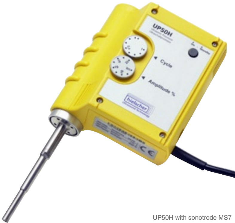
UP50H with sonotrode MS7

The ultrasonic processor UP50H (50 watts, 30kHz) is the smallest model of our aesthetic laboratory devices, that are only supplied by Hielscher Ultrasonics in that compact form.