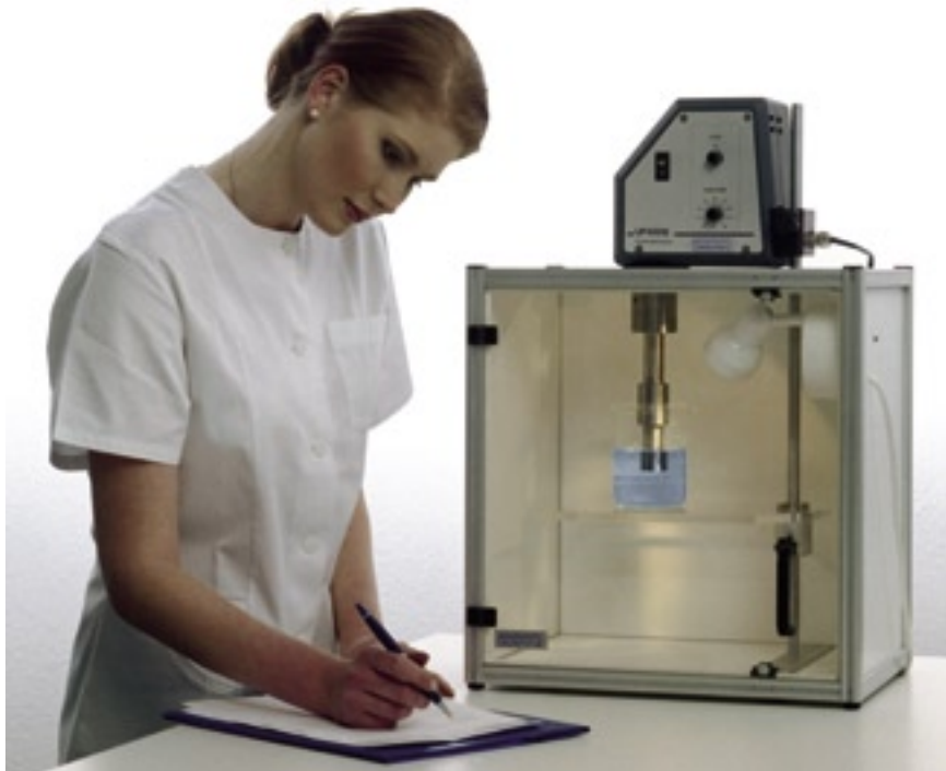
UP400S with H22 in sound protection box

The ultrasonic processor UP400S (400 watts, 24kHz) is our most powerful laboratory device. With sonotrodes of a diameter range from 3 to 40mm the device is suited for sample volumes from 5 to 2000ml. In flow approx. 10 to 50 liters per hour can be treated. For the preparation of test portions the UP400S is mainly used for bigger volumes. It is suited for the practical process development in the laboratory but also in the college of technology as well as for the production of small quantities. For production quantities a PC-control or a connecting lead to a central control of the user's plant is recommended in order to raise the process safety. With special flow cells and flange connections liquids can also be sonicated at high temperatures and pressures.