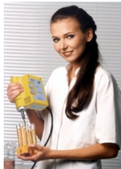
UP100H with MS7

For continuous operation only a flow cell and the appropriate 7mm sonotrode is required. Continuous processes in the smallest scale can be simulated. The optional PC-control may be helpful, if a test record is necessary or to optimize processes.