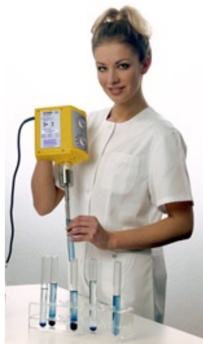
UP200H with S7

We offer a comprehensive range of accessories for the UP200H such as flow cells, stand, sound protection box, timer and PC- control.