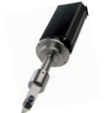
cutting and welding