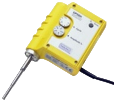
ultrasonic laboratory processors