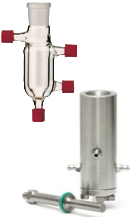
flow cells GD7K and D7K

The ultrasonic processor UP100H (100 watts, 30kHz) has the same dimensions as the UP50H but it is suited for the double power output. With the use of the 10mm sonotrode the field of applications expands to applications with volumes of up to 500ml. All other features and standard equipment are equal to those of the ultrasonic processor UP50H.