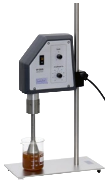
UP200S with S40

As all our laboratory devices the UP200S finds its customers worldwide. Without any additional fees we supply our devices with the adequate supply voltage (100 to 110V) and with the corresponding plugs.