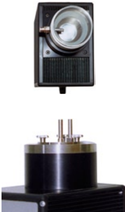
UTR200 as reactor chamber

The sonoreactor UTR200 (200 watts, 24kHz) works as an ultrasonic bath but at a 50 times higher intensity. In addition, it is dry-running protected. It is suited for the direct or indirect sonication of liquids e.g. for cell disruption, homogenizing or emulsifying. The beaker-shaped sonotrode is machined from one piece in order to prevent leakages. The upper part of the sonotrode is oscillation-free and can be used for mounting the respective accessories for diverse application cases. A corresponding reactor cover takes the Eppendorf tubes or test tubes for indirect sonication. By means of the reactor cover the chamber is hermetically sealed. If the cover has an additional inlet and outlet the sonoreactor can be used as a flow system. A sieving extension with a bajonet lock takes a pile of sieves for fine grain sizes (diameter 75mm, finest mesh size 5 micron). The ultrasound, which is transmitted to the sieves, accelerates the wet sieving process.