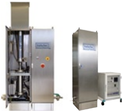
ultrasonic dispersing systems