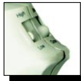
Mode control switches

Easily accessible switches on the FastPette allow different operation modes depending on the application. For aspiration, the user can choose HIGH or LOW work speed. Set to HIGH, the FastPette can fill a 25 ml pipette in just 4.3 seconds! Setting the speed to LOW enables precise measurement of the smallest volumes. Dispensing can be carried out by gravity (GRAV) or supported by the pump (BLOW) which enables complete emptying of the pipette with blow out. In addition, pipetting speed can be further controlled by the amount of pressure on the trigger buttons.