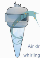
Air drawn into the liquid in a whirling motion to form a vortex.