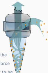
Particles pulled against the wall due to centrifugal force and separated from air to be concentrated into the liquid.