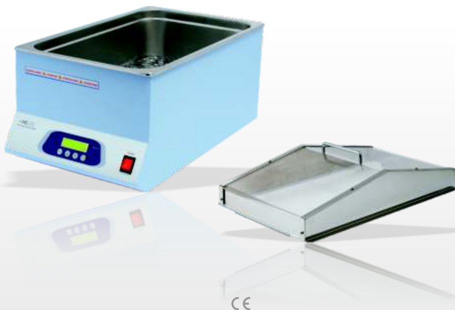
Cat. No. :SWB-20L series